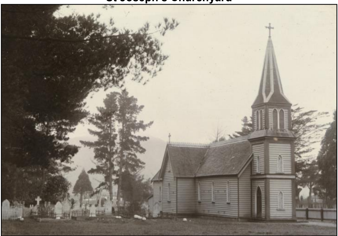
(Reference UH City Library Recollect website St Joseph's Catholic Church P4-54-640)

St Joseph's Church is situated on the corner of Pine Avenue and Main Street in Upper Hutt.