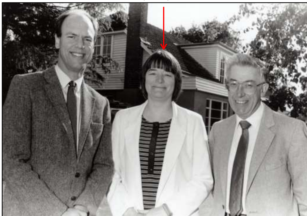
(Reference Upper Hutt City Library Heritage collection UH Leader 05 November 1995)