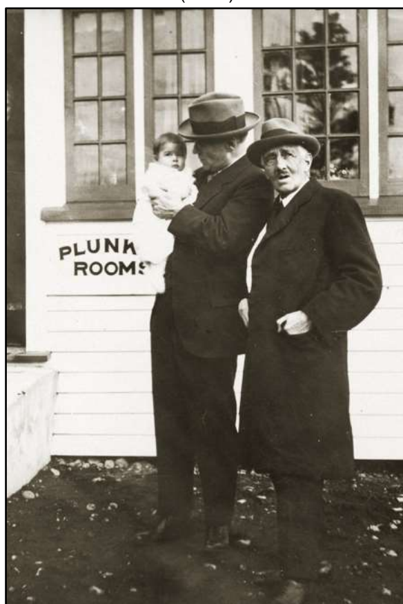
(Reference Upper Hutt City Library Heritage collection Plunket rooms P1-58-821)