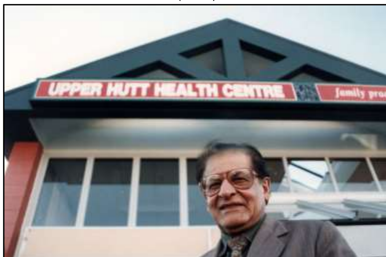
(Reference Upper Hutt City Library Heritage collection UH Leader newspaper 18 June 1997)