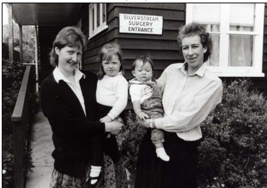
(Reference Upper Hutt City Library Heritage collection UH Leader newspaper 25 September 1990)