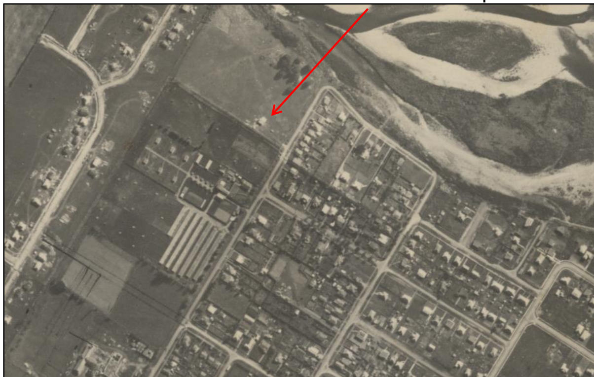
(Reference Upper Hutt City Library website Recollect Aerial map 1951 Upper Hutt mosaic sheet P-7-3-73)