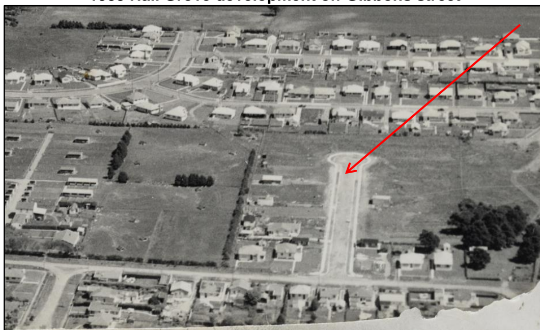
(Reference Upper Hutt City Library website Recollect Aerial view 1955 south-west Gibbons Street Cora Prout collection)