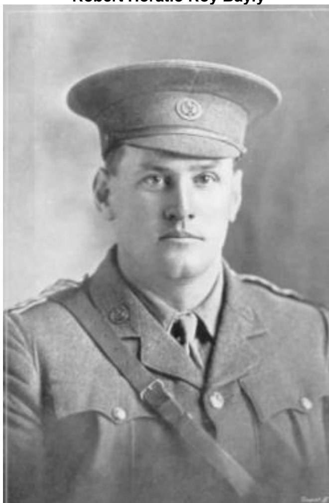
(Reference He Toa Taumata Rau online Cenotaph database Auckland Museum King College Honour Roll)