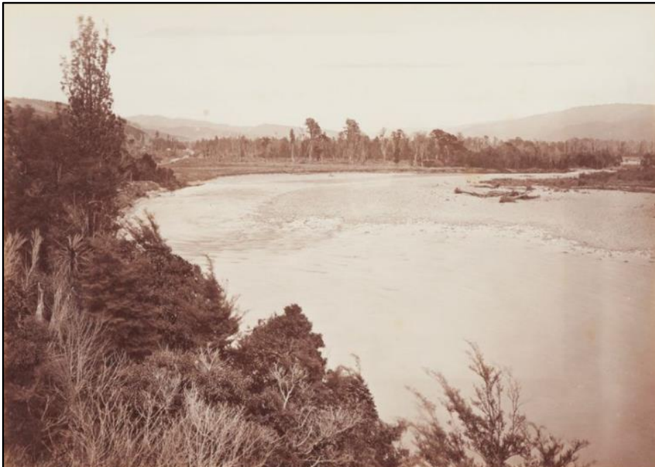
(Reference Upper Hutt River at the Fern Ground – Wellington and Masterton Road NZ from the album "Photographs of New Zealand Scenery Wellington to the Wairarapa" Te Papa Tongarewa Museum of New Zealand)