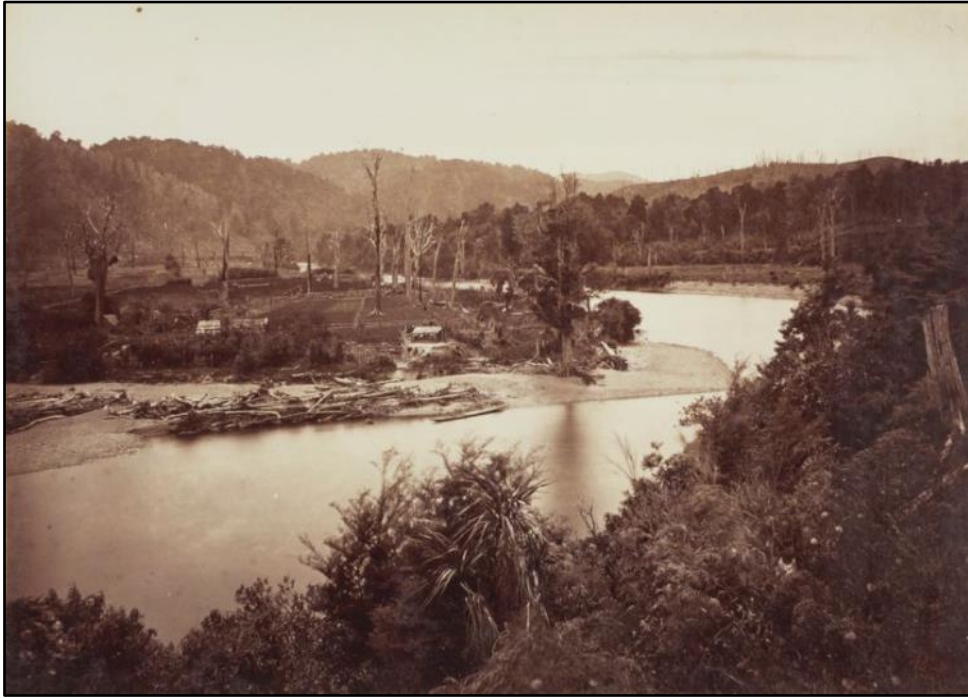
(Reference Upper Hutt River at the Fern Ground – Wellington and Masterton Road NZ from the album "Photographs of New Zealand Scenery Wellington to the Wairarapa" Te Papa Tongarewa Museum of New Zealand)