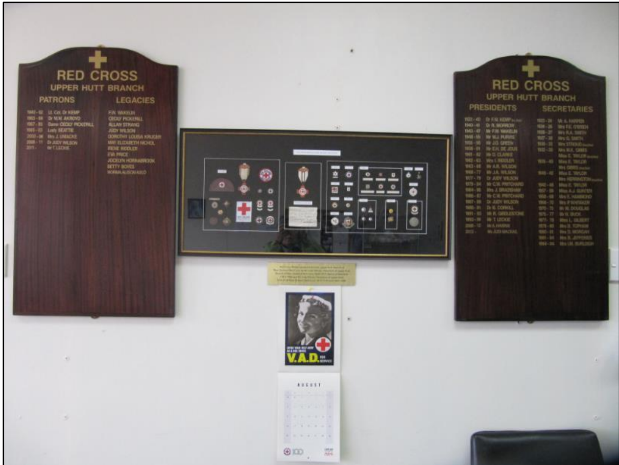
(Reference private saved as Red Cross UHHonoursBoard&Display=IMG_1707.jpg)