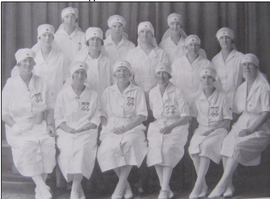
(Reference private image saved as Red Cross UHNurses14VAD=IMG_1713.jpg)

The 1926 photograph of fourteen V.A.D. (Voluntary Aid Detachment) nurses who were part of the Upper Hutt Red Cross organisation have been identified.