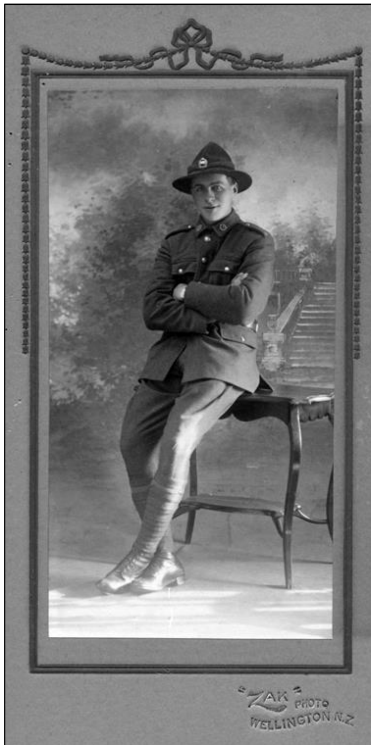
(Reference Golders Cottage image collection)